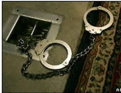
The US has admitted using secret prison to detain terror suspects

The human rights groups say that people have been arrested in countries including Pakistan, Iran, Iraq, Sudan and Somalia and flown in "extraordinary renditions" to secret US prisons.