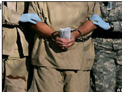
Some prisoners were moved from secret sites to Guantanamo Bay

Amnesty International Cageprisoners Center for Constitutional Rights Center for Human Rights and Global Justice Human Rights Watch Reprieve